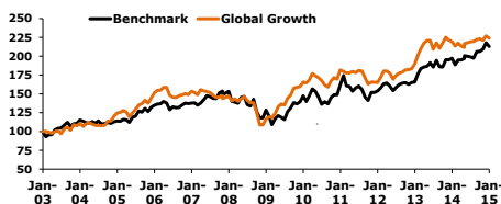
(As calculated by Overberg 31 Dec 2014)