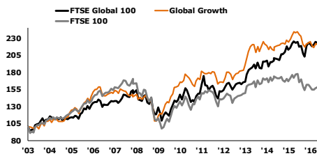
(As calculated by Overberg 29 July 2016)