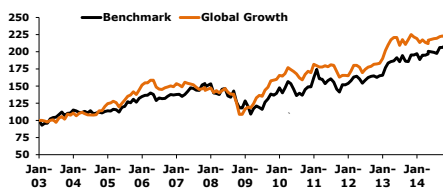
(As calculated by Overberg 31 Oct 2014)