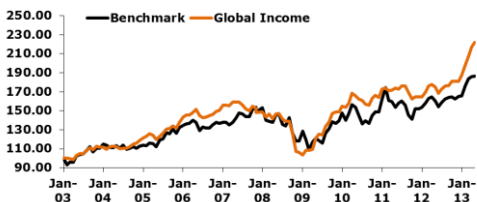
(As calculated by Overberg 30 Apr 2013)