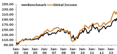
(As calculated by Overberg 31 Aug 2013)