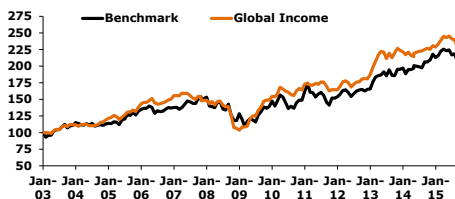
(As calculated by Overberg 31 Aug 2015)