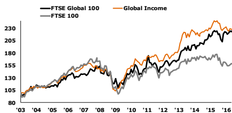
(As calculated by Overberg 31 Aug 2016)